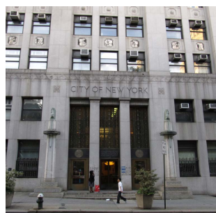
NYC Department of Sanitation (USA)