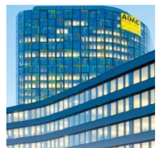
ADAC Headquarters Munich (Germany)