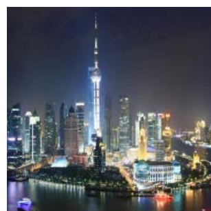
Vossloh-Schwabe Shanghai office (China)